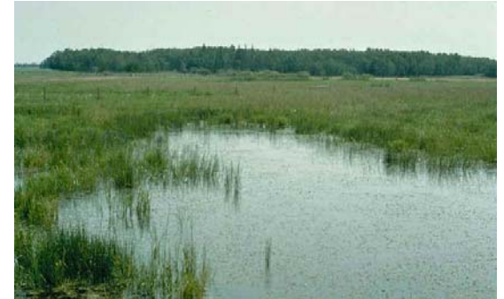
Habitat and species